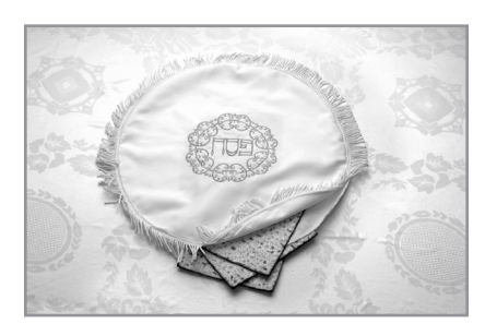
Matzah Tash (Bread Bag)

Matzah Tash – This is the matzah bag, also referred to by many Jewish people as the Echad , meaning "unity." It contains three compartments with one slice of unleavened bread (matzah) in each compartment. The second compartment contains the Afikomen.